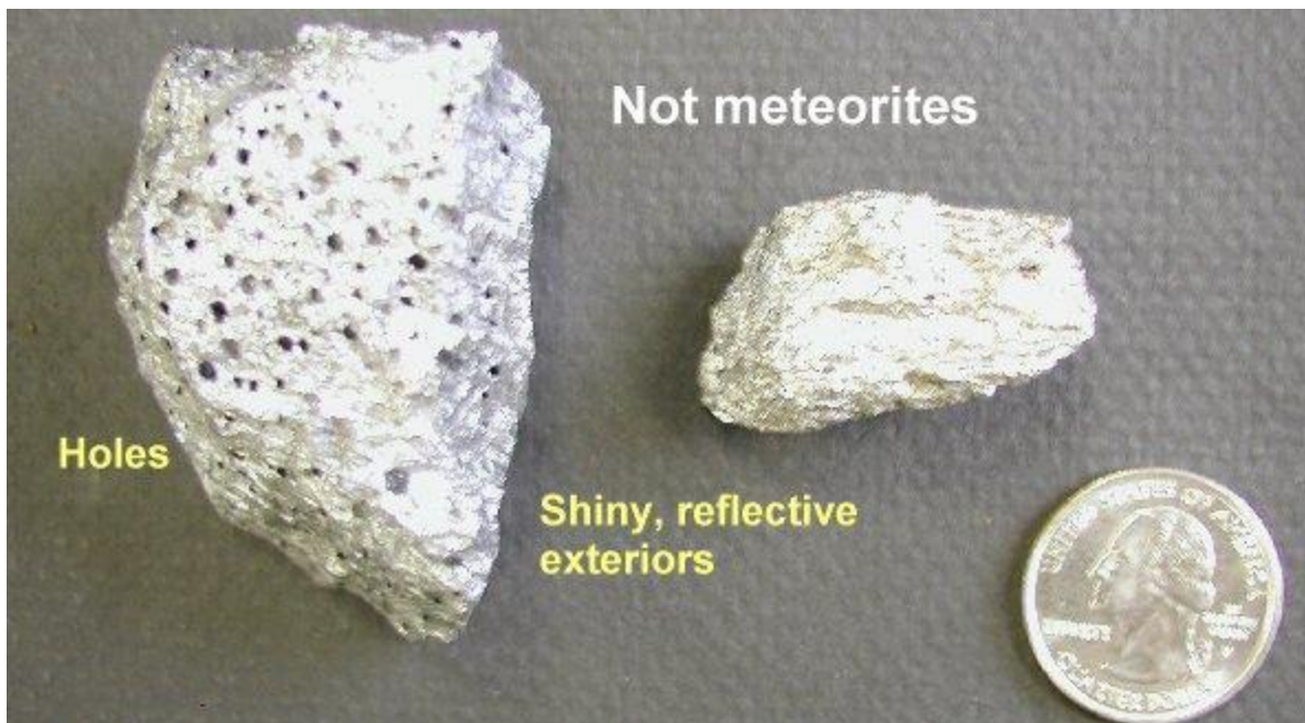
Specimens with silver or metallic, highly reflective exteriors that have been found in Kentucky, but are not meteorites.

3). Is the specimen metallic, shiny, and silver? Meteorites are rarely bright and metallic on the outside, although they can be on the inside. Specimens that are bright and metallic on the outside, and have been found in the ground in Kentucky, may be man-made metallic silica slag. If the specimen is shiny on the outside it is not a meteorite.