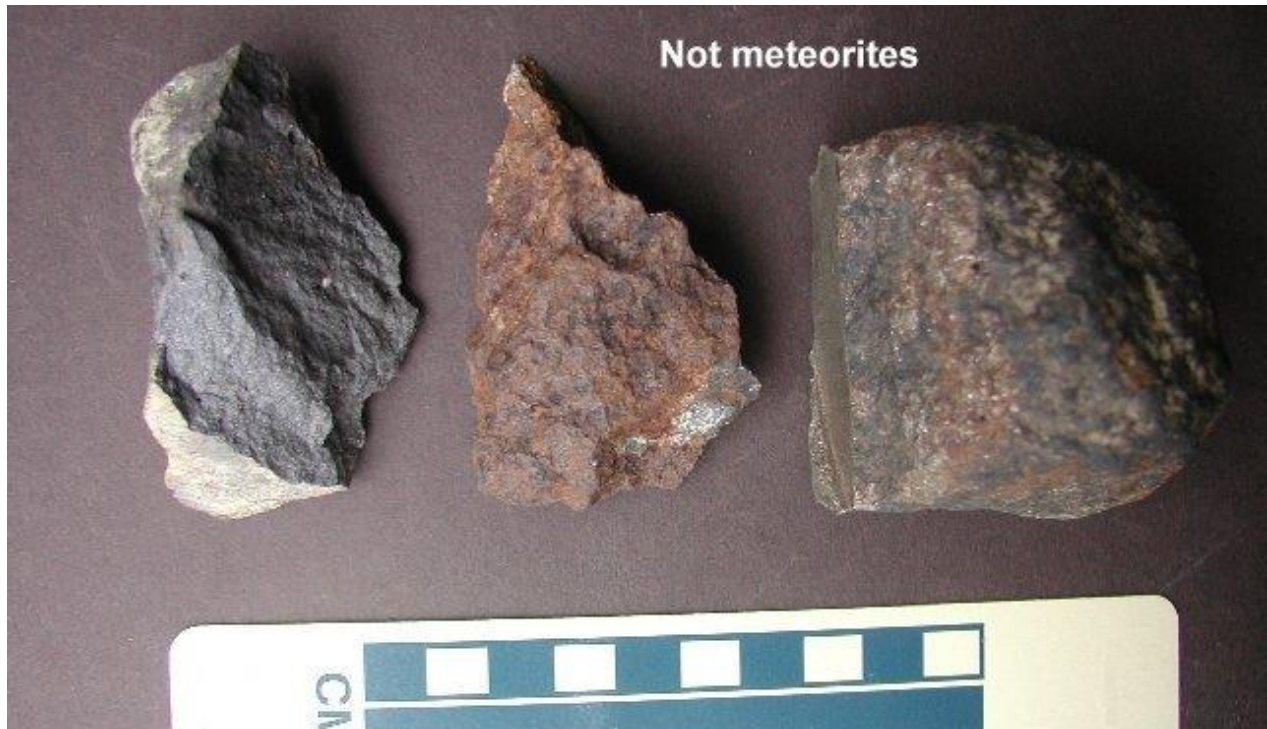
Specimens with iron-colored or drab-colored exteriors and metallic interiors (silver or gold) that have been found in Kentucky, but are not meteorites

3). Is the specimen metallic, shiny, and silver? Meteorites are rarely bright and metallic on the outside, although they can be on the inside. Specimens that are bright and metallic on the outside, and have been found in the ground in Kentucky, may be man-made metallic silica slag. If the specimen is shiny on the outside it is not a meteorite.