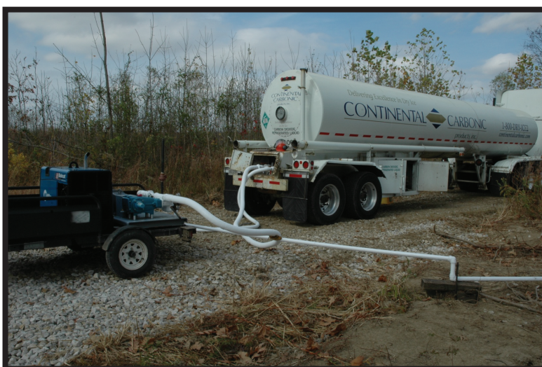
Liquid CO 2 being off-loaded from tanker truck (20 ton capacity) into injection pump where CO 2 was pressurized to 850 to 1,350 psi as it was injected into the Euterpe test well. Transfer lines are white due to frost as the CO 2 in the lines was very cold (-109°F).